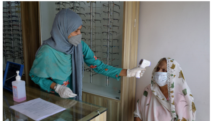
A woman has her temperature checked at a vision centre

In 2021, we continue to support our partner hospitals in the face of the pandemic so that together we can save sight and save lives. Right now, we're focusing our COVID-19 response efforts in India, Nepal and Bangladesh, where our partner hospitals urgently need PPE and life-saving supplies. We also continue to educate communities about COVID-19 prevention. To learn how you can help, visit operationeyesight.com/covid-19 .