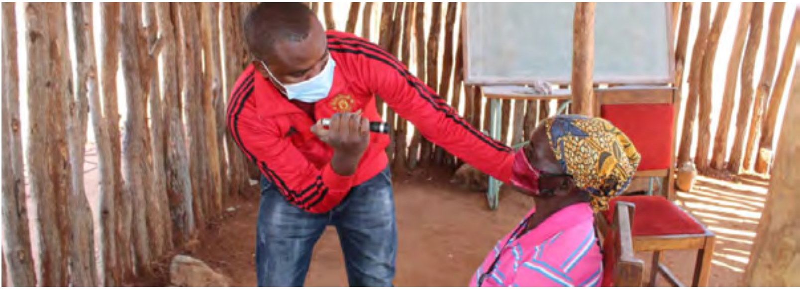
A woman has her vision tested at an Operation Eyesight outreach screening camp in Zambia's Sinazongwe District.