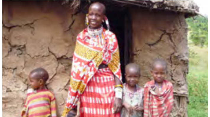
A mother in Kenya poses with her three children.

Kenyan schools closed their doors in March 2020, and there is still no set plan to facilitate a safe return to school. Virtual learning sessions are available online, on television and on the radio, but most students cannot access them because they do not have electronics or reliable internet access at home. There is a significant risk that online working and learning will make existing inequalities even worse. As the COVID-19 pandemic stretches on, the economic, mental and physical side effects of the pandemic are becoming increasingly apparent. With schools closed, it means that Operation Eyesight is unable to conduct school screenings and refer children with visual impairment to the care they need.