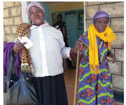
This woman couldn't hide her joy as she escorted her mother-in-law to the eye clinic.

In the week leading up to the event, the eye unit held a free eye screening camp. More than 1,000 people from the surrounding community were screened for vision problems, and 40 patients received sight-restoring cataract surgery. These numbers indicate the high demand for eye care services in the county.