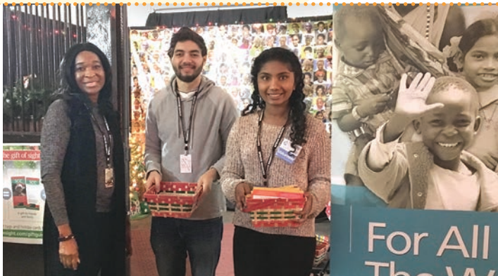
Warmest thanks to our terrific volunteers for your hard work at Christmas — and every day! We couldn't do it without you!