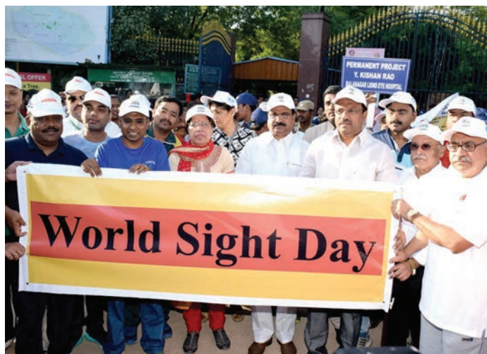
Over 1,000 people, including Dr. C. Laxma Reddy, Minister of Health and Family Welfare, Government of Telangana, participated in the “Walk for Vision” in Hyderabad, India to increase public awareness of eye health.

Our activities included the grand opening of a new eye unit in Kenya (see inside), a partnership seminar, a “Walk for Vision,” media briefings, community and school eye screenings, vision centre inaugurations, a radio campaign and various speaking engagements. To further mark the occasion, we declared 20 more villages in India avoidable blindness-free , bringing the total number of avoidable blindness-free villages in that country to 170! What an impact, thanks to your support!