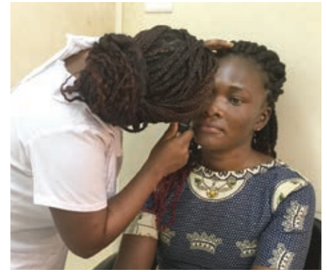
An ophthalmic nurse examines a patient's eyes at Tarkwa Municipal Hospital in Ghana. By educating staff members at partner hospitals on all aspects of eye health care, we help instill appreciation of the importance of the eye care programs they're helping to implement. This builds the staff's pride and ownership in their work!

This approach has served us well in reducing costs and improving patient services, while ensuring the continuity of the project. Our sustainable practices ensure our programs – and the community