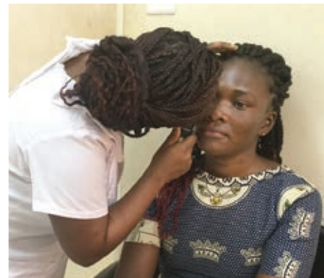
An ophthalmic nurse examines a patient's eyes at Tarkwa Municipal Hospital in Ghana. By educating staff members at partner hospitals on all aspects of eye health care, we help instill appreciation of the importance of the eye care programs they're helping to implement. This builds the staff's pride and ownership in their work!

This approach has served us well in reducing costs and improving patient services, while ensuring the continuity of the project. Our sustainable practices ensure our programs – and the community