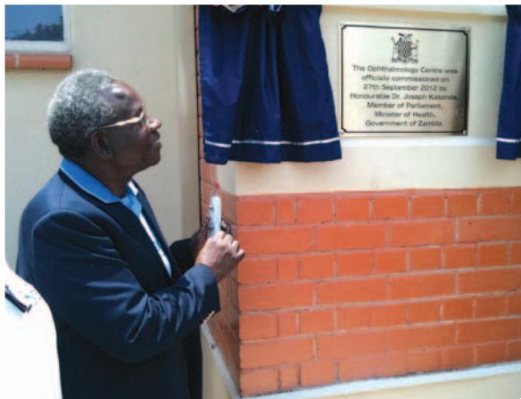
Zambia's Minister of Health at the opening.

The ophthalmic centre is the culmination of eight years of hard work and strong partnerships between Operation Eyesight, Nava Bharat Ventures Limited of Hyderabad, India,