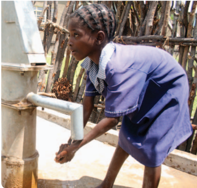
This schoolgirl in Zambia enjoys access to fresh water, thanks to our generous donors!

"As the cliché states, an ounce of prevention is worth a pound of cure," says Rob. "Not only is clean water the epicenter of eye health, it nurtures huge benefits from education to farming to healthcare to the ability to strive to a better life. It allows people to live, not just exist."