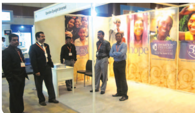
Members of the India team gather at Operation Eyesight's booth.

Operation Eyesight was well-represented when more than 1,600 of the best and brightest minds of the global eye care community met in Hyderabad, India last September for the Ninth General Assembly of the International Agency for the